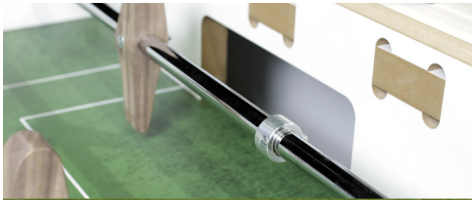
4 pcs. spacers (next to goalie)*