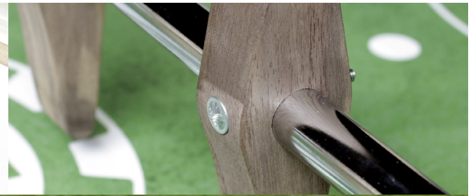
figurine mount 22 screws M4/40 (handle screws)