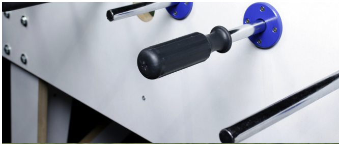
8 pcs. table football handles to match the rods*