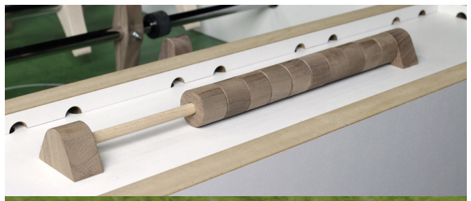
2 pcs. wooden dowel 8x352