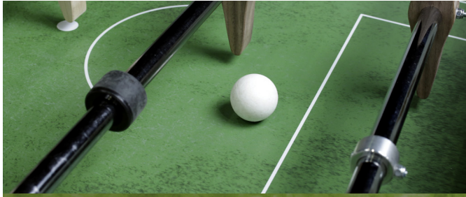
Tabel football ball*