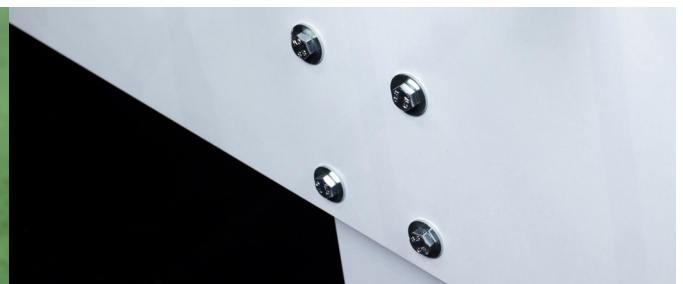
feet mount on body 24 pcs. screws M8x60 24 pcs. washers M8 24 pcs. Nuts M8 self-locking