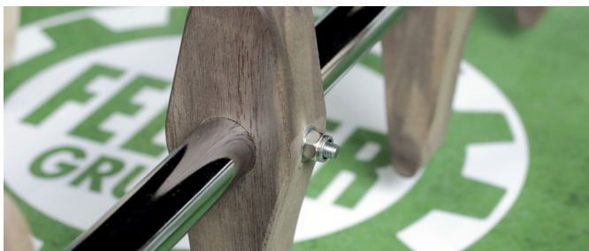
figurine mount 22 nuts M4 self-locking 22 washers M4