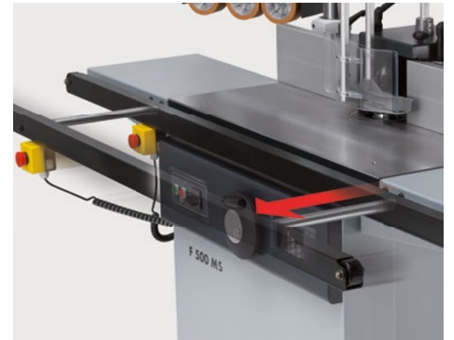
Table extension with front pull out support

Spindle fence "230" for max. tool Ø of 230 mm, MULTI adjustment system for spindle fence "230" for parallel alignment and quick adjustment.